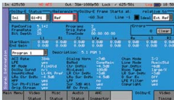
Dolby E Timing, Program and Metadata display

Note: Dolby E audio will not be decoded.