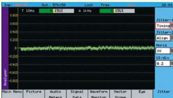
Full screen display of the jitter wave form with access to decade filters. Automatic measurements via thermometer readings.

The separate jitter analysis screen incorporated into the advanced option enables the engineer to analyse the nature of jitter present using a graph of jitter versus time. Again, the decade filters are present and the time base can be adjusted from 1 line through to 1 frame. By analysing jitter in this detailed way an engineer can determine if a signal is in or out of specification and also get a feel for where any problems lie. A spiky waveform could indicate power supply noise and these visual clues aid the diagnosis. Vertical gain and horizontal magnify controls are provided to help further identify problems.