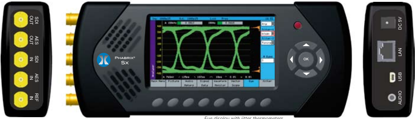
Eye display with jitter thermometers