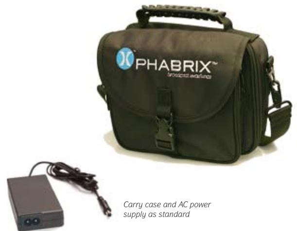
Carry case and AC power supply as standard