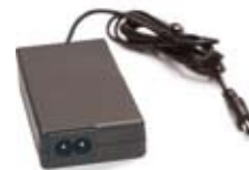
Carry case and AC power supply as standard