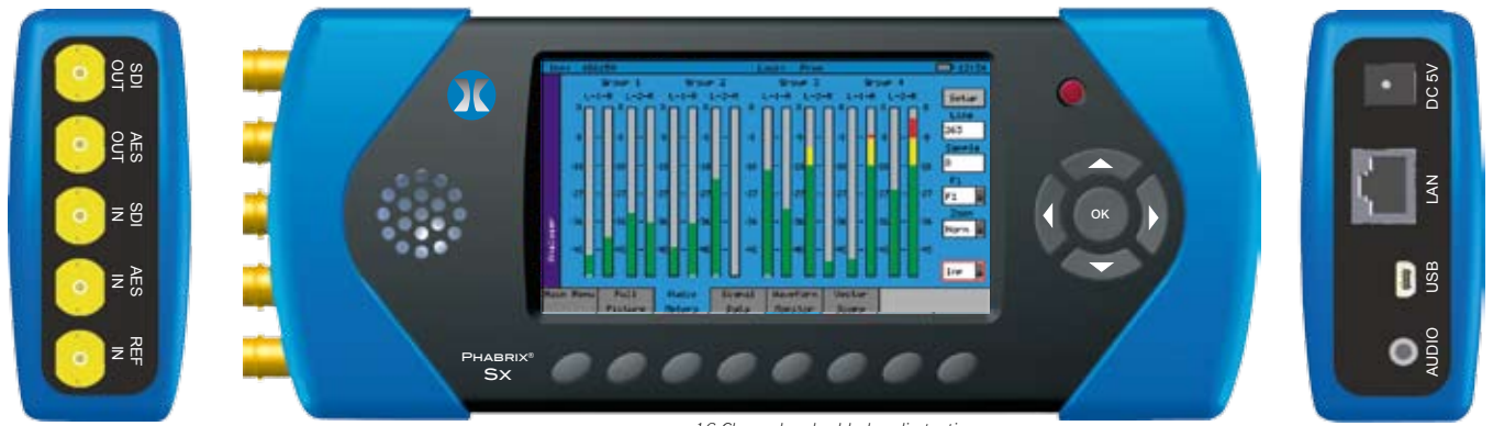
16 Channel embedded audio testing screen