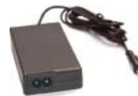
Carry case and AC power supply as standard